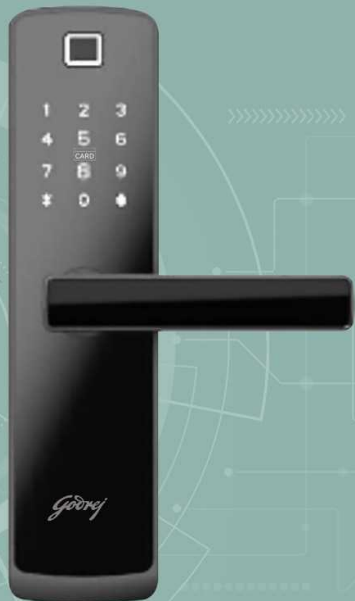
CATUS TOUCH PLUS