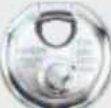
P 390 SS