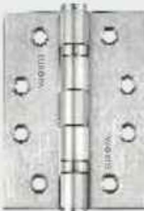
SS Hinges Ball Bearing