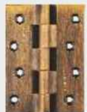
Railway Hinges Brass