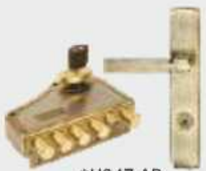
*H347 AB with Reversible Plate Handle