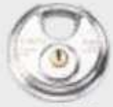
P 170 SS